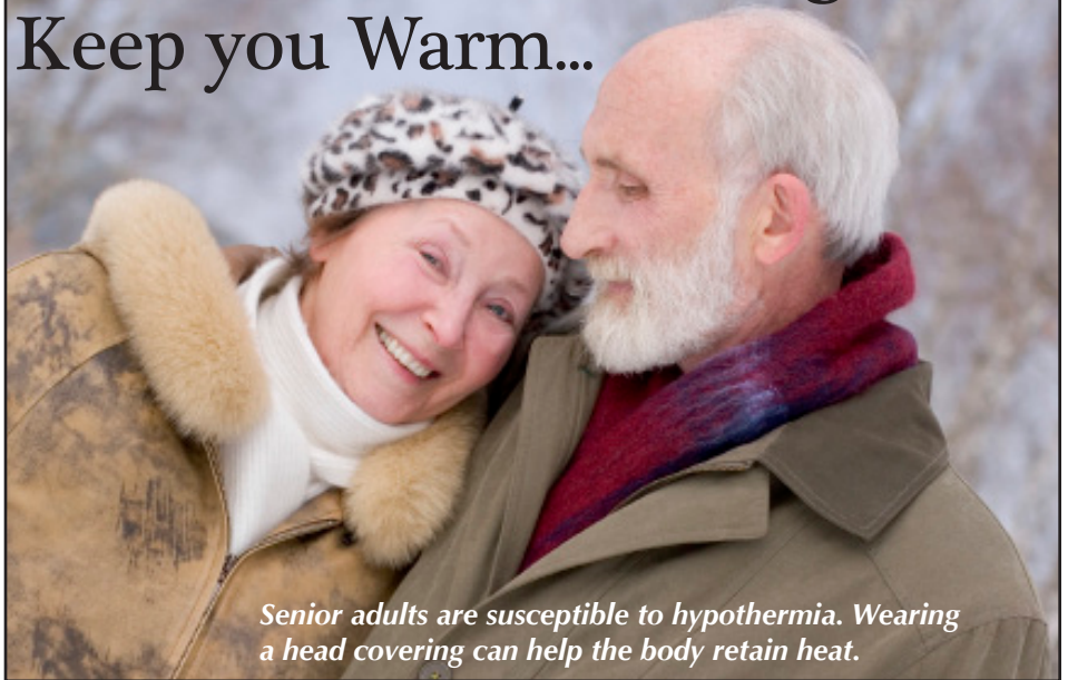
Senior adults are susceptible to hypothermia. Wearing a head covering can help the body retain heat.

Irving Berlin wrote I've Got My Love to Keep Me Warm in 1937 and it became a popular hit song that year. It is a nice sentiment. Of course, love alone won't keep the cold away. Senior adults, especially, need to know the signs of hypothermia and what simple measures they can take to avoid it. Because they often make less body heat due to a slower metabolism and less physical activity, seniors are particularly at risk for hypothermia when out-of-doors or in an inadequately heated home.